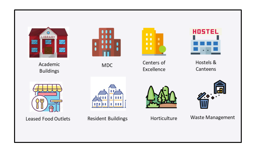
Fig.: Inclusions under Organizational Boundary

IIM-B has extensively studied their organizational structure, operational boundaries & operational context while choosing the inventory boundary across all three Scopes of emissions.