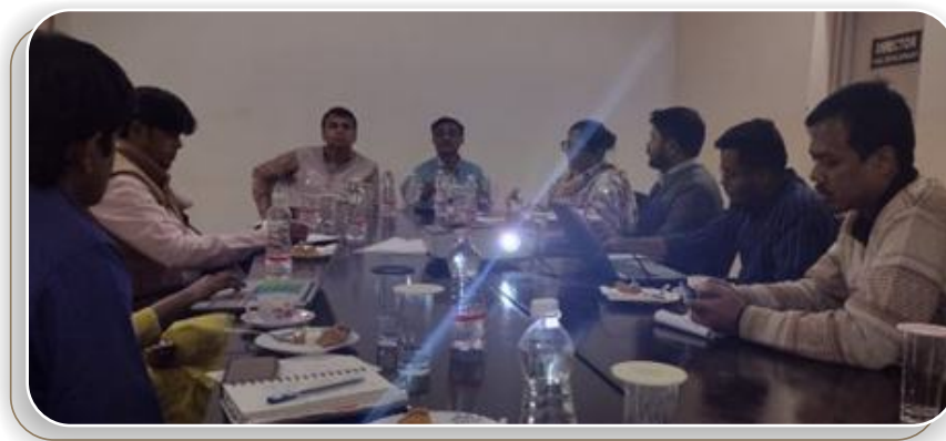
Tripura MGNF Cohort during meeting at SSDM