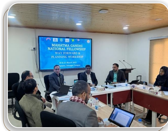
Program Team from all partner IIMs during workshop at IIM Jammu, Srinagar