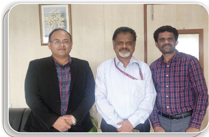
Program Managers, MGNF, IIMB with Officials in Delhi