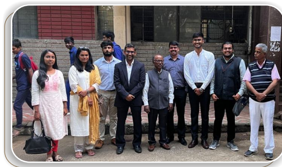
Karnataka Cohort Fellows with MD and Officials from KSDC