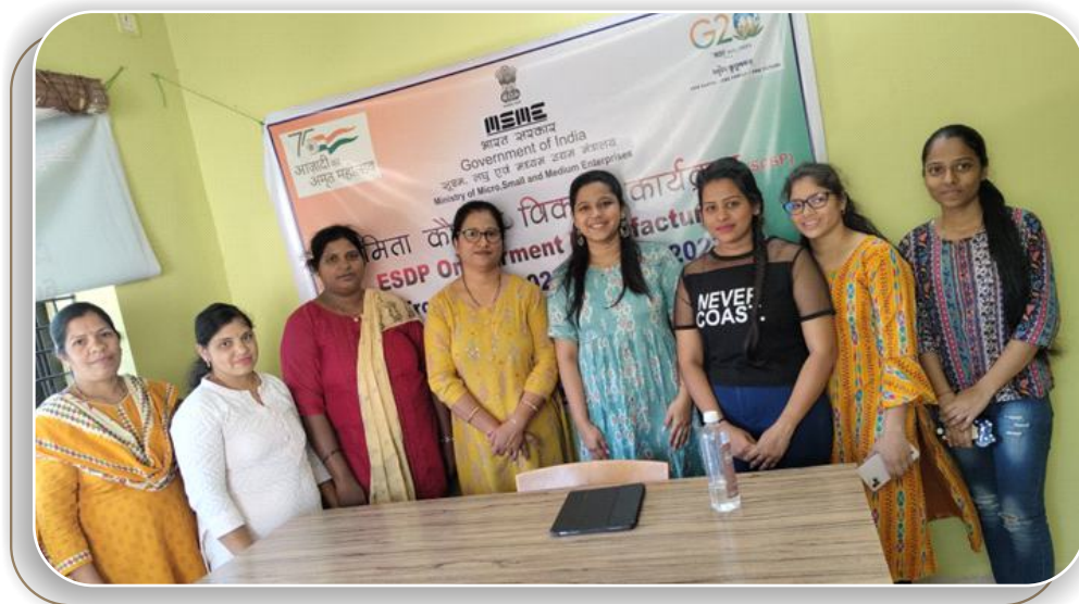
MGNF Shama with beneficiaries of skill development training program

Page' to increase engagement and visibility. The training included sessions designed to boost participants' self-confidence, ensuring they leave with the necessary tools and knowledge to succeed in their ventures. The beneficiaries are now better equipped to start their own venture and thrive in the competitive world of entrepreneurship.