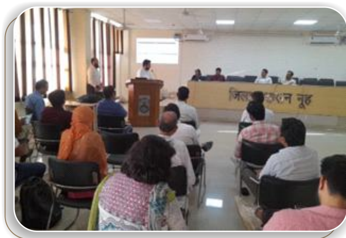
Review meetings for NGO cell, Nuh under the Chairmanship of Deputy Commissioner

Regular review meetings for this NGO cell are held under the chairmanship of Deputy Commissioner, Nuh. In these meetings, various NGOs working in Nuh give presentations regarding their progressive work in the district. These NGOs are working with District administration to make sustainable improvements in the field of Education, Empowerment, Health & Nutrition, Skill development & Livelihood, etc. MGNF is working closely with the NGOs, CSRs, and Foundations working for strengthening the skill ecosystem of the district.