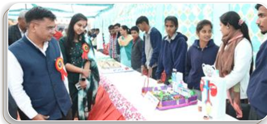
Skill exhibition cum competition organised in Charkhi Dadri, Haryana

MGN Fellow is further, aiming at possibilities to provide greater placement opportunities to these young minds while streamlining the scope of vocational education in the district and making them market-ready.