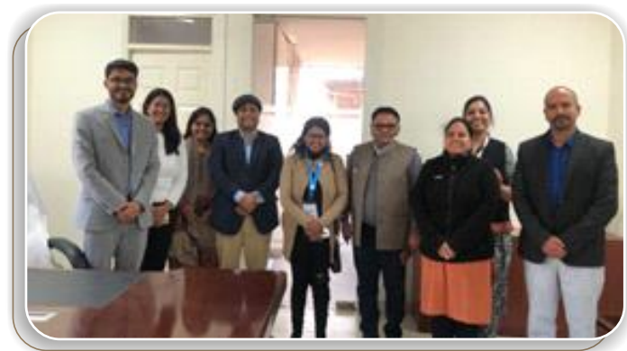
Uttarakhand fellows and SRA with Officials from UKSDM and NSDC

The fellows also met UKSDM officials including Secretary UKSDM and NSDC officials and discussed further activities they can be engaged in with UKSDM. The discussion held with these officials was insightful and gave a larger picture of how skill training and skilled students are representing India on a global level.