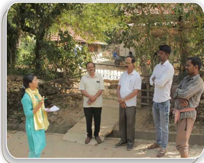
Interaction with the members of the Lamps Co-operative at Gangana Saralu, Koppa, Chikkamagaluru District

Post a brief meeting with the District Skill Development Officer about the contribution and role the MGNF has played in the department, the faculty also met with the DCF of Bhadra Tiger Reserve who has been working with the fellow for a pilot project on building capacity in the district for Nature Guides for eco-tourism. The discussion entailed the future prospectus of the skill training and also the involvement of concepts of the Village Forest Committee for new projects.