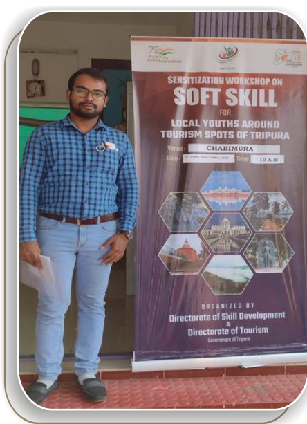
MGNF Ashis during Sensitization workshop on Soft Skill for Local Youth around Tourism Spots of Tripura

Jamatia Hoda' society who all are managing Chabimura tourist properties. People who participated in the workshop were from profiles like the society management committee, auto/car drivers, chefs, hotel owners, cleaning staff, boat drivers, and hawkers. They were taught about a set of personal attributes that enable individuals to interact effectively with others, such as communication skills & greeting gestures, teamwork for smooth functioning and managing a bunch of guests to make their experience memorable, adaptability to any weather conditions, fluctuating visitor numbers, sudden changes in customer needs, instant friendship with new people, and on spot problem-solving attitude. In the tourism sector, soft skills play a critical role in delivering excellent customer service and enhancing the overall visitor experience & positive feedback, which will increase tourist frequency exponentially, which the Skill Directorate, the Directorate of Tourism, and MGNF want to achieve through these Soft Skill sensitization workshops.