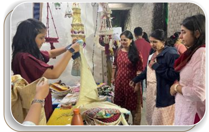
A group of Fellows during presentation of group work