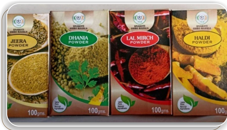
Packaging of products of Yeazekhowra SHG Village Federation

Packaging of products of Yeazekhowra SHG Village Federation In addition to these, the majority of the women working in the 7 SHGs are involved in operations, sales, and manufacturing. They are also able to manage their finances and track their performance. These qualities help SHG women expand their businesses by improving productivity, relations with customers, and profitability. These women are now truly an inspiration in the field of rural entrepreneurship.