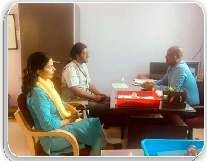
Fellow and Faculty Mentor interact with the Chikkamagaluru District Skill Development Officer