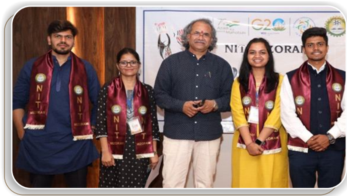
Four fellows from Haryana Cohort visited Mizoram in collaboration with IIM Rohtak and NIT Mizoram