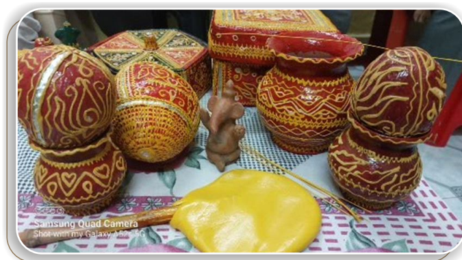
Finished products made using lacquer craft