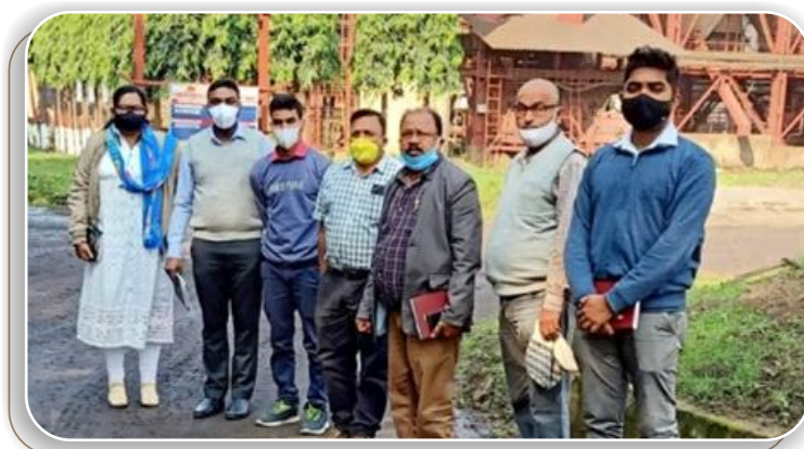
MGNF Pulak with District Officials

MGNF Pulak with District Officials With the pursuit of introducing the aforementioned job roles, Fellow discovered that the District Mineral Foundation had funds to spend on skill development programmes, but lacked the necessary infrastructure and processes. In order to capitalise resources of DMF, he launched a project by engaging with the Mining Sector Skill Council and submitted a DPR describing the district's unique skill deficit. The fellow then scheduled a meeting with Mining SSC, Line department officials, and DMF to bring all possible stakeholders of this project together on the same platform. Following the discussion, Mining SSC developed a plan for the district that covered all 10 key employment positions. The District Mineral Foundation agreed to invest in this project after acquiring placement assurance from Mining SSC.