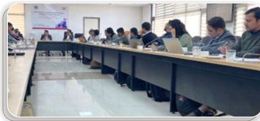
Haryana MGNF Cohort during meeting at HSDM, Panchkula