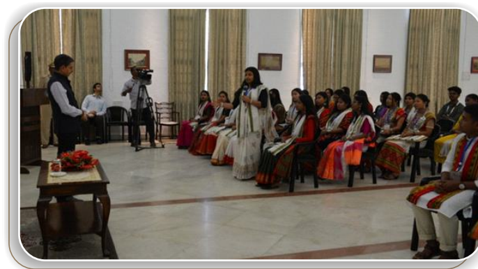
MGNF, Khowai, Tripura interacting with Governor, Tamil Nadu during the visit