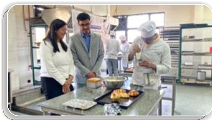
Uttarakhand fellows during Baking competition held at IHM, Dehradun