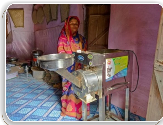
Member working on grinding of spices